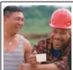
Makin' It Work (Returning Citizen)