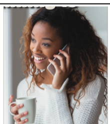
Beginning to Work It Out (At Risk Youth)