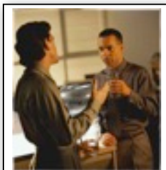
Workin' It Out (New Employees)