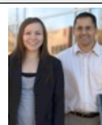
Workin' w/ Tradition (Native Job Seeker)