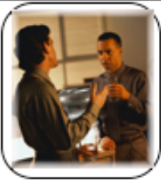
Workin' It Out (New employees)