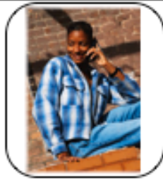
Beginning to Work It Out (At-Risk Youth)