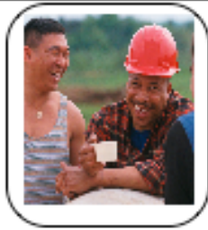
Makin' It Work (Ex-Offenders)