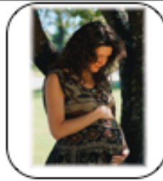
Learning to Work It Out (Hard-To-Serve)